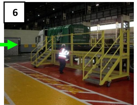
Open canopy from ground level. Push platforms against trailer, apply brakes and check for movement.