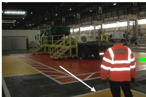
Access your trailer by the platform steps only. You MUST stand in the driver 'Safe Zone' during loading