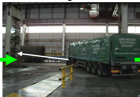
Exit the Cold Mill by via the one way system. Be aware of rail workers.