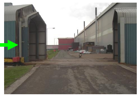
Continue through the opening when the doors come to a stop. Be aware of oncoming traffic.