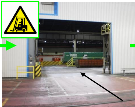
Go through the Gantry, and park in the centre of the red loading area. Ensure your handbrake is on and engine is off.