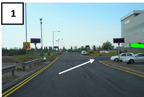
Drive left out of the Lorry Park and over two Level Crossings.