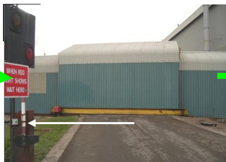
Stop your vehicle in front of the sliding door- press the green button to open.