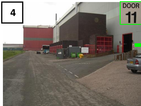
Turn right, into the despatch bay. The door will be labelled 'Door 11'. Please note you will have to wait if rail movement is occurring.