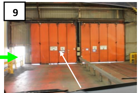
Pull up to the left exit door. This will open automatically.