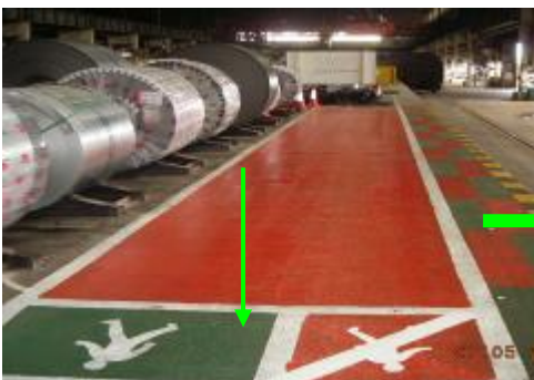
You MUST stand in the adjacent driver 'Safe Zone' during loading