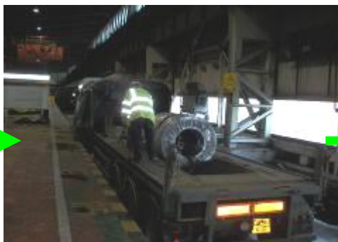
Secure the load in line with the Tata LRG 0008 Load Restraint