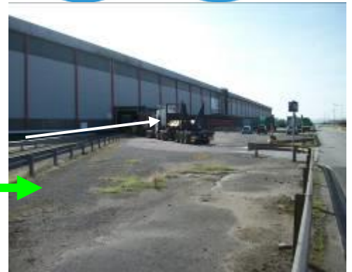
On entering the bay be aware of traffic leaving the Service Centre on your left side.