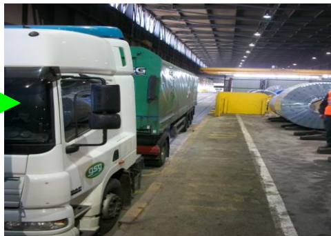
Exit from cab into the lorry dock. Access dock wall via steps on trailer, maintaining three points of contact at all times.