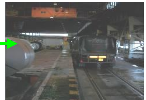
Unsheet your trailer and prepare for loading.