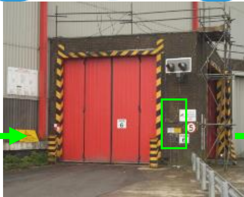
You may have to open the bay door using the control panel.