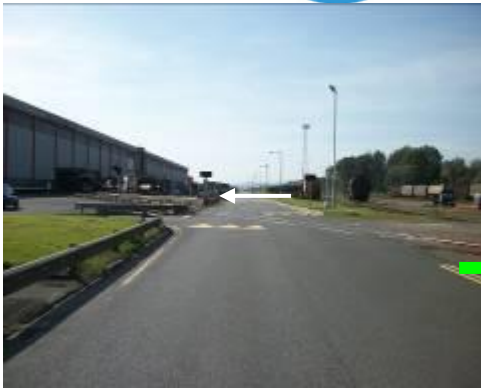
The road entrance is on the left, please note that this is the turning after the railway tracks. Marked 'IN'.