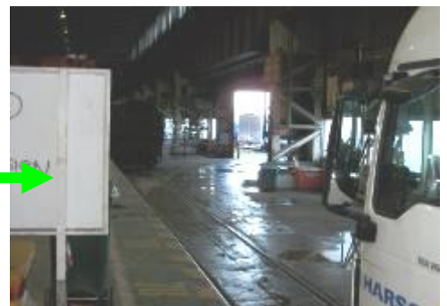
Exit the despatch bay via the bay door ahead on the right hand side. Be aware of wagon loaders ahead.