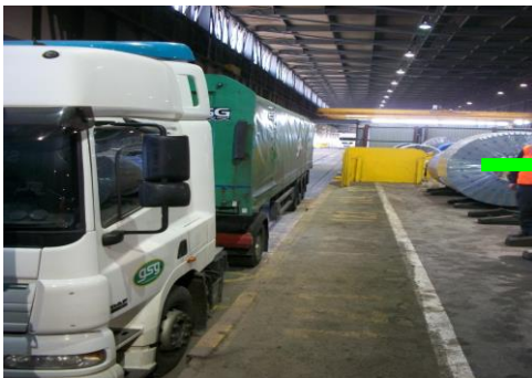
Park trailer adjacent to the furthest forward loading area & wait for the Stocker. Ensure your engine is off and handbrake is on.