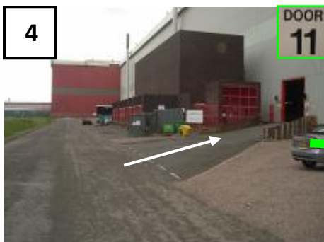
4 Turn right, into the despatch bay. The door will be labelled 'Door 11'. Please note you will have to wait if rail movement is occurring.