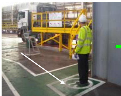
You MUST stand in the adjacent driver 'Safe Zone' during loading.