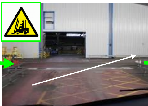
Turn right when entering the Bay.