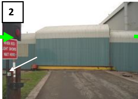
2 Stop your vehicle in front of the sliding door. Press the green button to open.