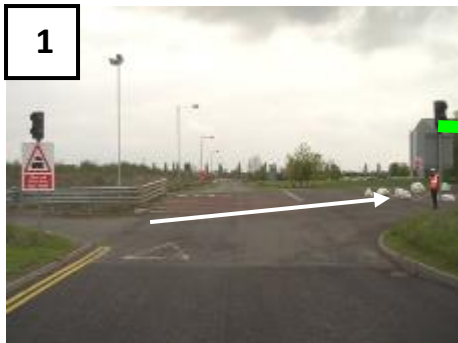
1 Drive left out of the Lorry Park and over two Level Crossings.