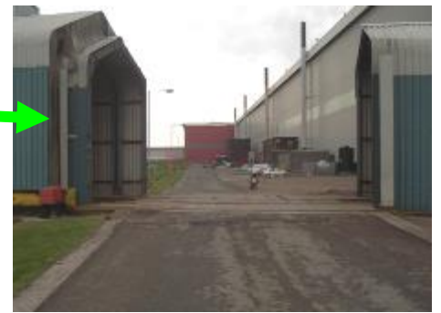
Do not drive through until the doors have stopped moving. Be aware of oncoming traffic.