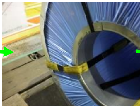
Secure your load in line with the TATA LRG0008 Load Restraint Guideline.