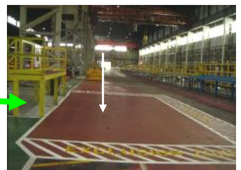
Park alongside platform in an available loading area and prepare trailer for loading. Ensure your handbrake is on and engine is off.