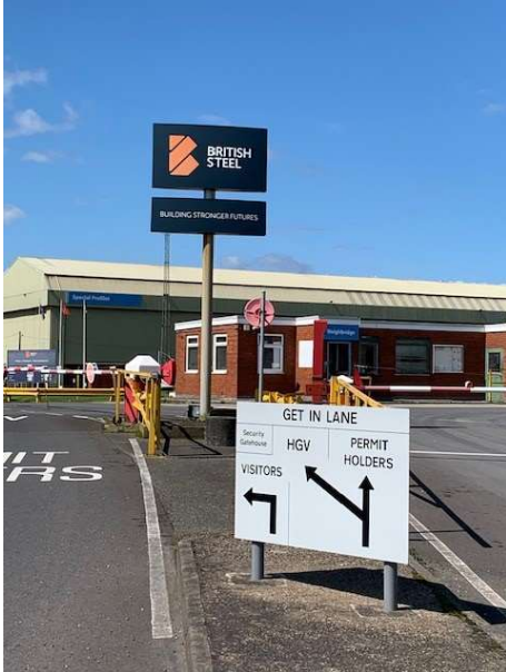
ON ARRIVAL STOP AT SECURITY GATE IN PPE