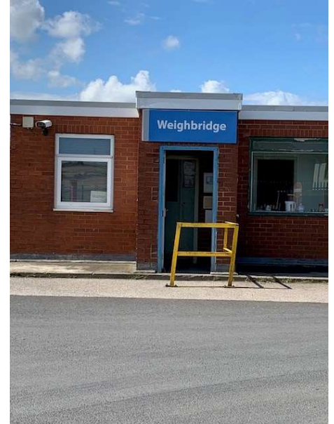
WEIGHBRIDGE Weigh ON