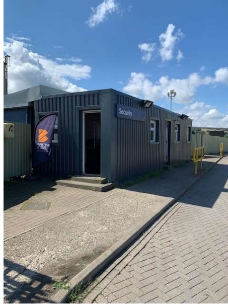
DRIVER RECEPTION / INDUCTION