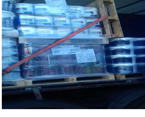
5. Over the top straps on every stack